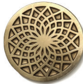
Dahlia 2.5" diameter inset