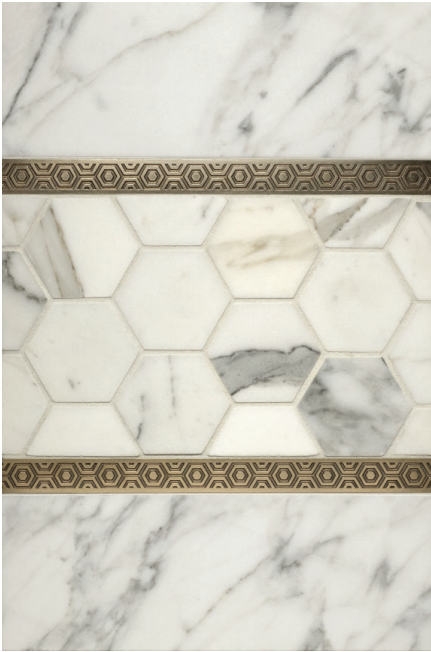
Holly Go Lightly concept Bebop 1×12" border Traditional Bronze