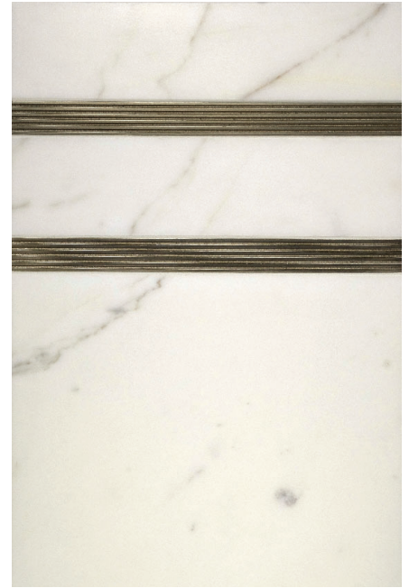
James Bond concept Tuxedo 1×12" border White Bronze