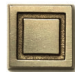
Square 1 × 1" corner/inset