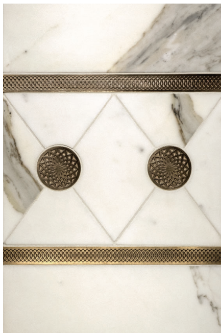
Juliet concept Octave 1×12" border, Dahlia 2.5" diameter inset Traditional Bronze