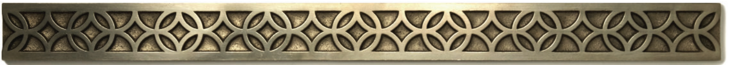
Galileo 1 × 12" border