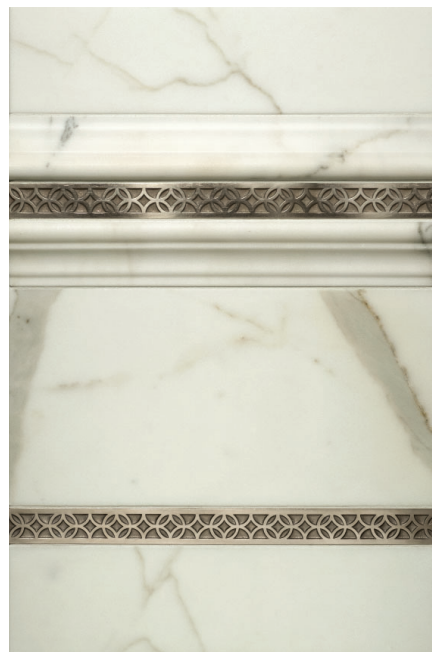
Mrs. Robinson concept Galileo 1×12" border White Bronze