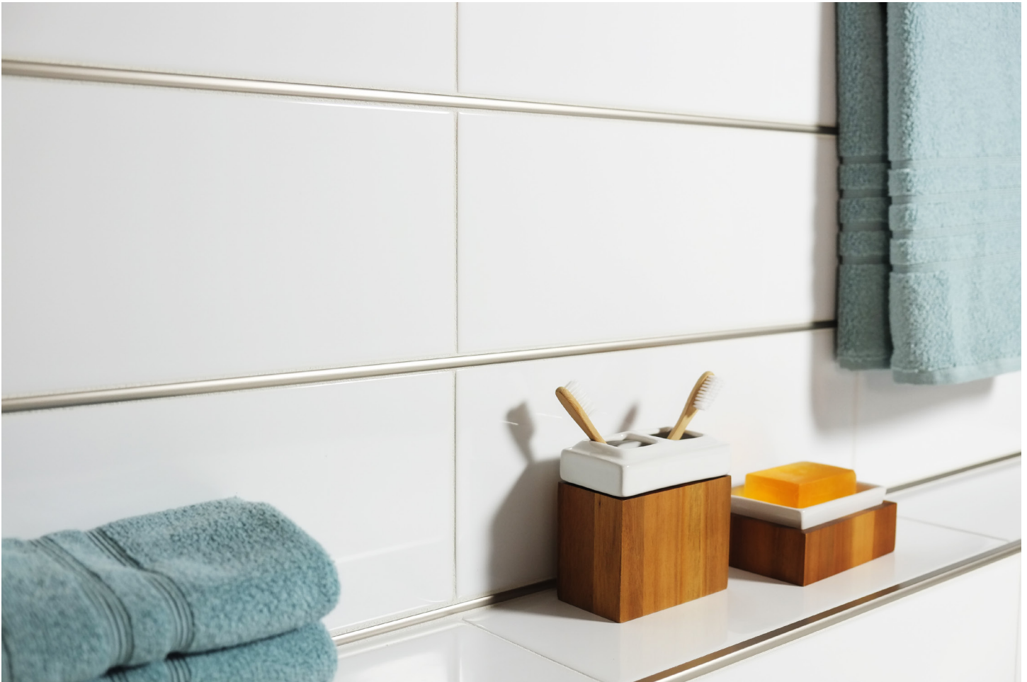
Bronzework Studio Precision Dome Liners in Satin Nickel, with white porcelain