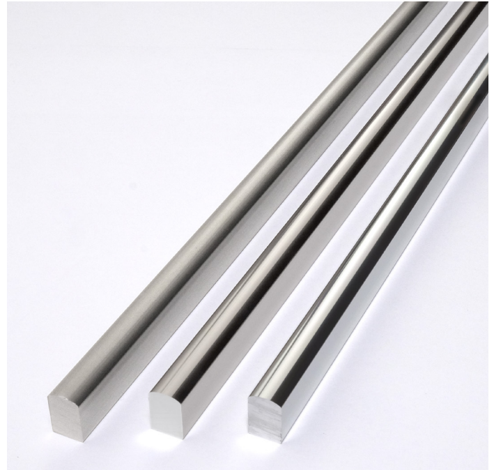
Satin Nickel, Polished Nickel, Polished Chrome

For full details, see our Installation guide (available on our website and shipped with every order).